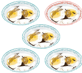
SOFT BOILED EGGS WITH SOY SAUCE