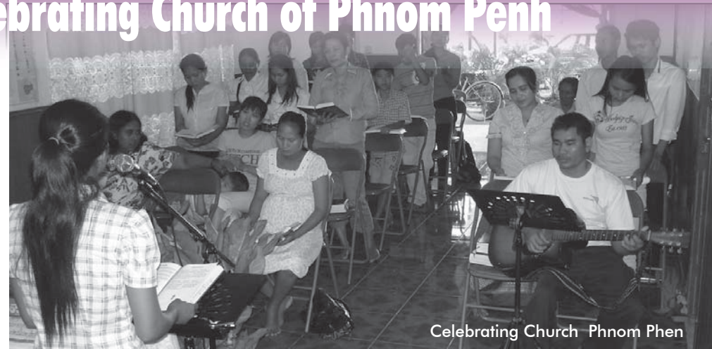
Celebrating Church Phnom Penh

Friendship, not location, is the drawcard. So, members come from both far and near. This also means their attendance is often influenced by the transport cost, and a few hold jobs requiring a seven day commitment.