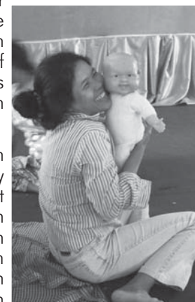
TBA learning neo-natal health care