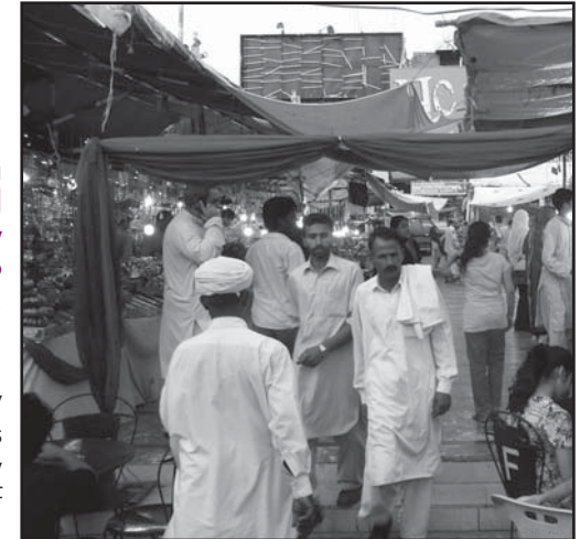
Image: Local bazaar

One day as he was selling Bibles in the bazaar, a policeman came to him and