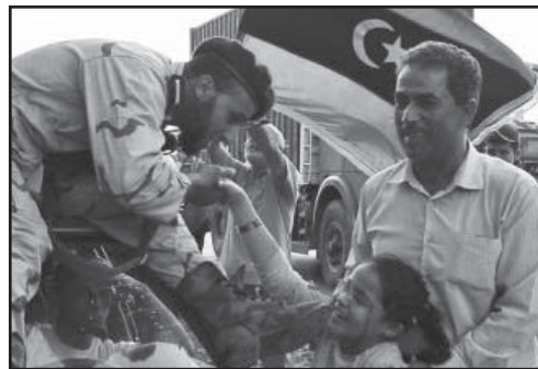
Image: Libyans celebrating a new era of freedom

This kind of power fails to impress God. Jesus modelled the kind of leadership that God wants, that of the servant who lays down his life for the sake of others, not someone who lords it over people. One who was prepared to come into our world in the form of a baby and to lay aside his authority as the Second Person of the Trinity for our sake. May we live lives of service which follow in the footsteps of Jesus.